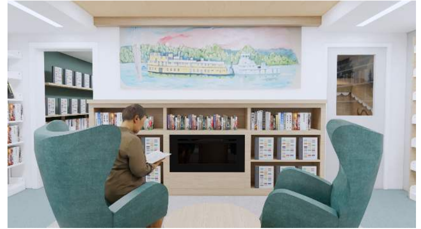
C) FIREPLACE NOOK