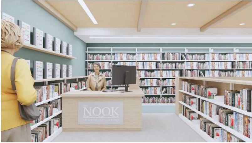
A) MAIN ENTRY