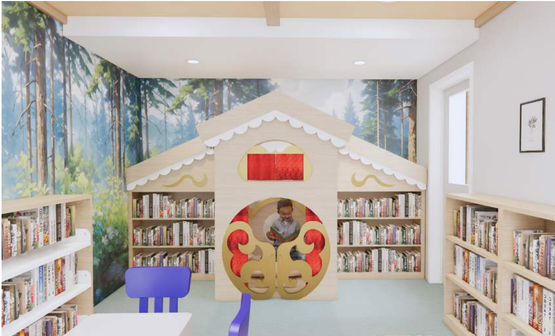
D) CHILDREN'S LIBRARY PLAYHOUSE